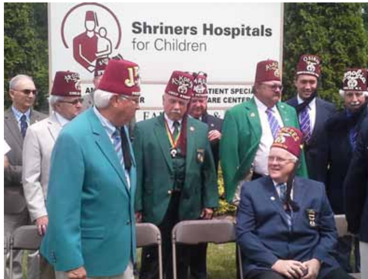
SHC – Erie Open House... Board Members take their place for the ceremony.