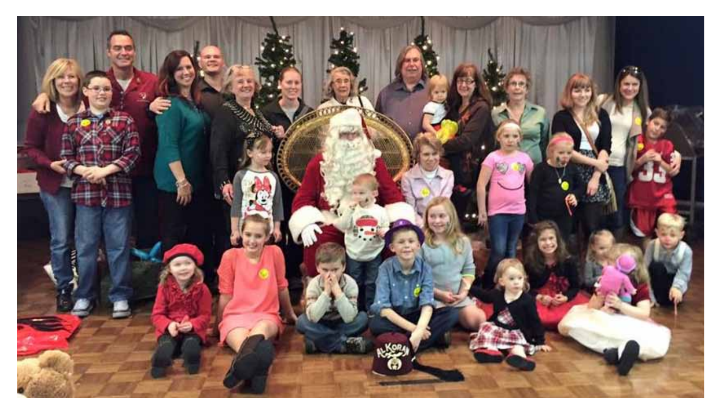
Children's Christmas Party