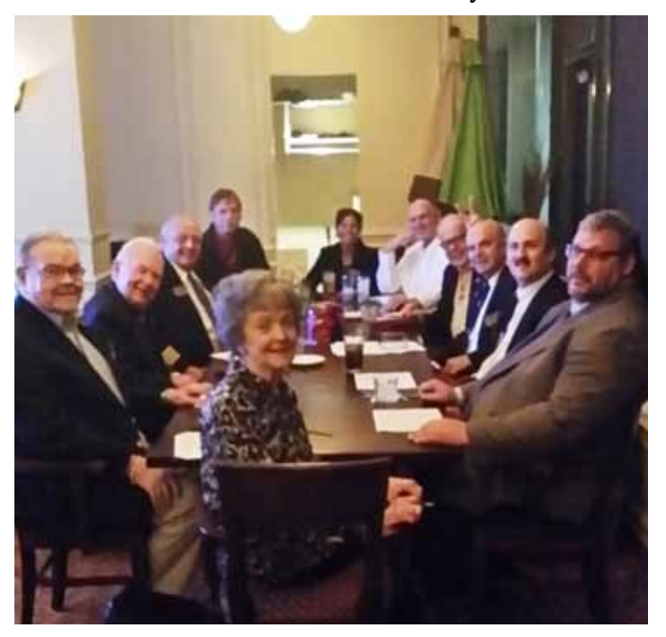
Southwest Shrine Club enjoying a night out