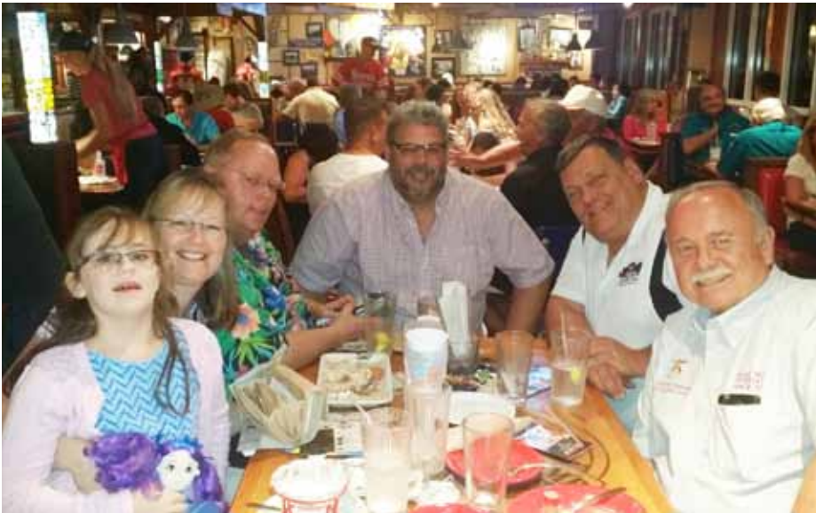
Al Koran's Imperial Representatives breaking bread together at Bubba Gumps Seafood at Imperial Session.