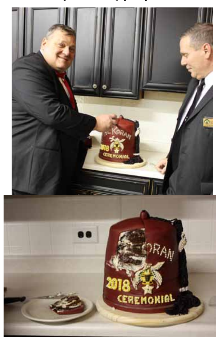
Yep... that "Ceremonial" Fez was a delicious 12 layer cake ... enjoyed by all.