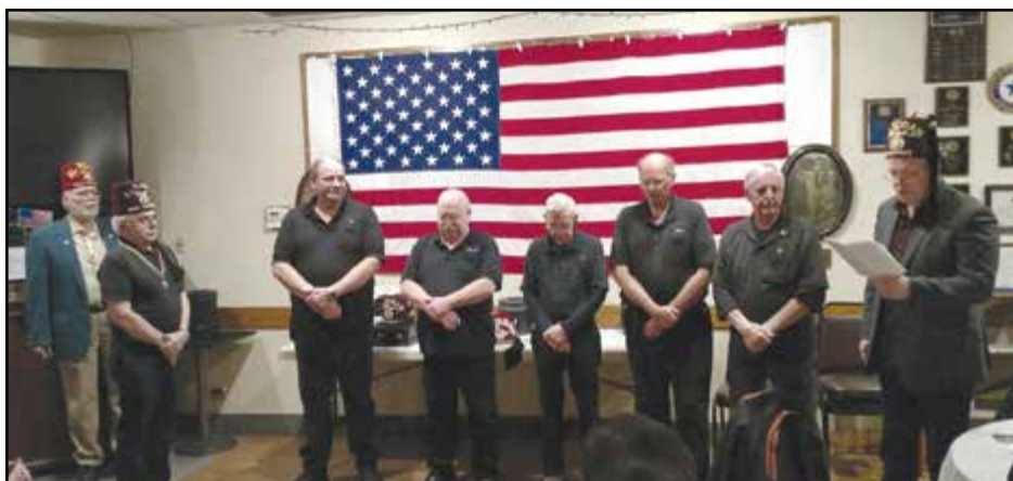
Korvette Installation of Officers