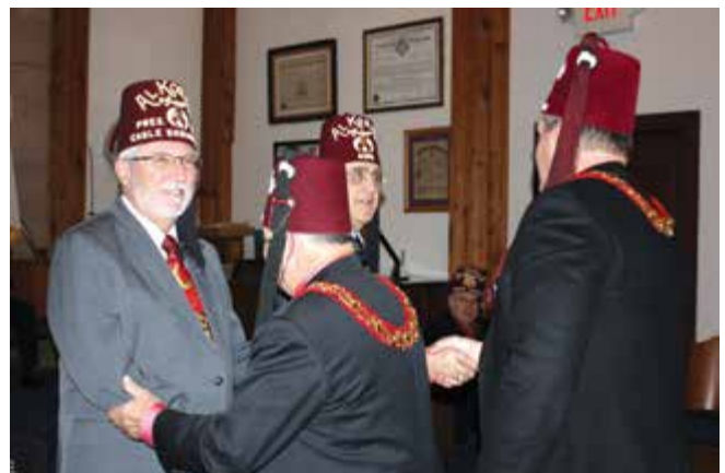
Past Master getting their specially designed pins for their service as Masters of their Lodges.