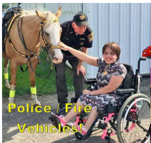
Police / Fire Vehicles!