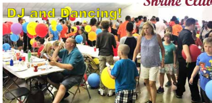
DJ and Dancing!

Mansfield A logo featuring a Shriner's hat with a star and a sword. Shrine Club