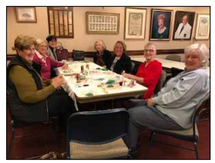
Ladies of Al Koran enjoy creating Christmas ornaments following Business Meeting dinner