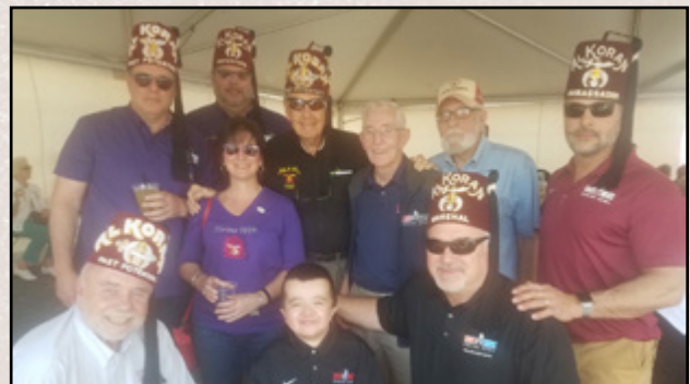
Tail-gate party bunch was thrilled with a visit from "Alec"