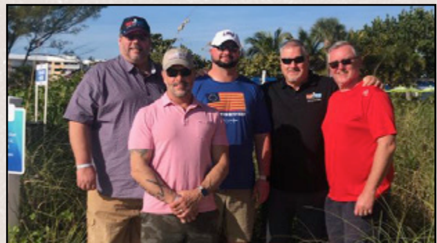
Al Koran East/West Shrine game guys