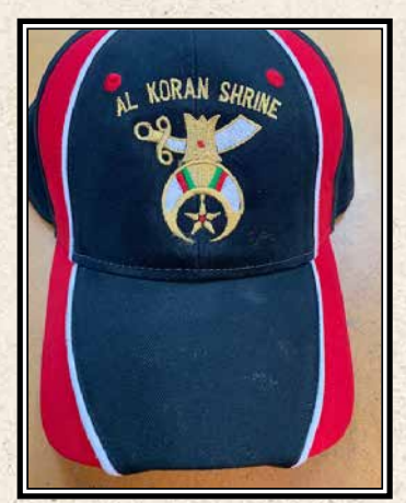
Potentate's Gold Cap