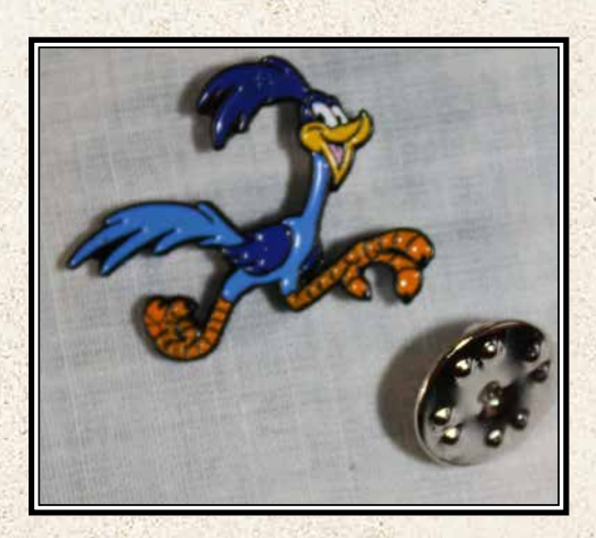
Roadrunner Drivers pin to be awarded.