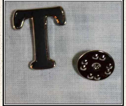
Top Line Signer pin to be awarded for recruiting new members.