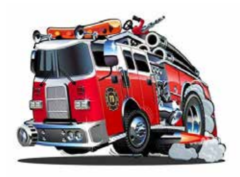
The Lorain Fire Brigade meets on Fridays at 11:00 AM for lunch and fellowship at Sorrento's Ristorante, 5223 Detroit Road in Sheffield Lake ... join them