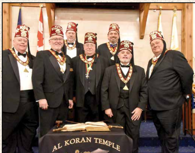
Al Korans Elected Divan for 2021