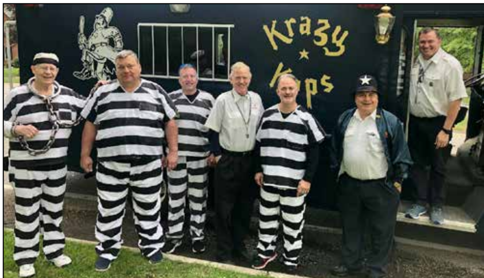
Kops thrill Westlake memorial Day Parade goers.

The Krazy Kops have various social events and we march in several parades throughout the year. We meet the 4th Monday of the month for dinner at 6:00 P.M. at Teamz Restaurant - 6611 Eastland Rd, Middleburg Heights, OH.