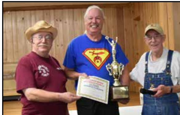
People Choice Chili Winner