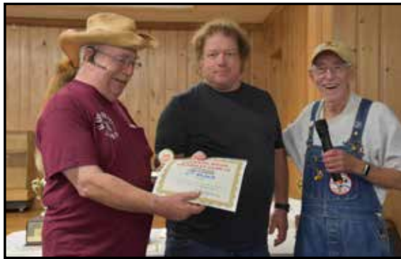
2nd place Chili