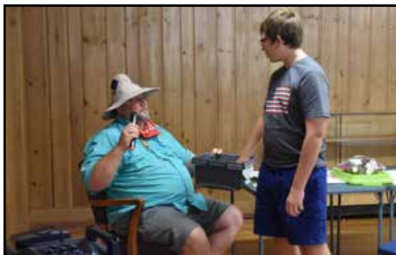
The Sideboard Winner is...