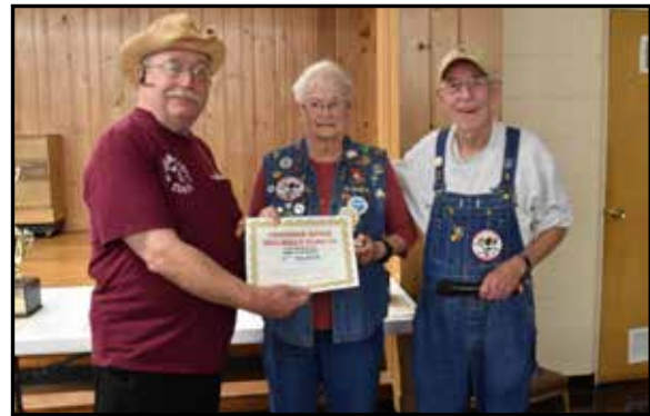
3rd place Chili