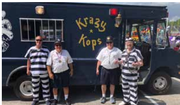
Al Koran Krazy Kops entertained all the parade route of the North Olmsted Homecoming.