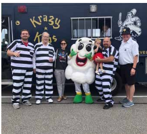
The Kops giving the crowd what they want at the North Ridgeville parade.