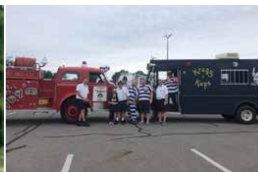
Big Red from the Lorain County Fire Brigade with the Krazy Kops Paddy Wagon at the North Ridgeville parade. This is the first time in decades that these two Al Koran vehicles have marched in the same parade.