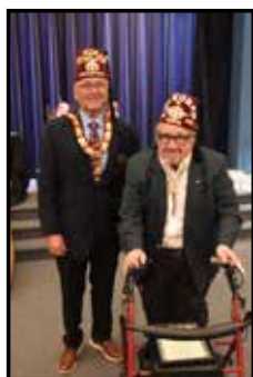
Congratulations to our 25 year and 50 year Shriners