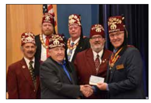
Mansfield SC has $1200.00 checks for both our medical facilities, in Erie and Dayton.