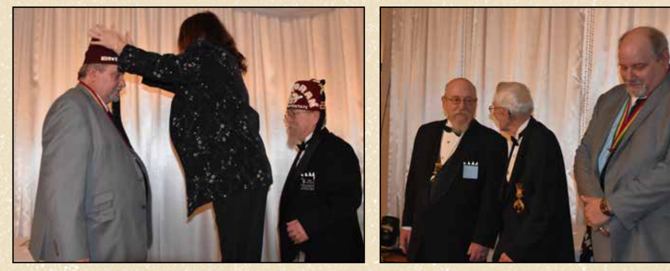
Korvette Unit officer Installation