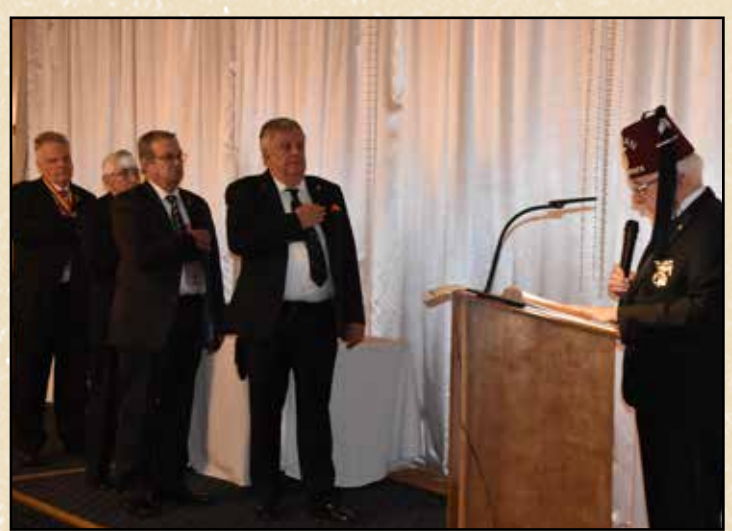
Legion of Honor Officers