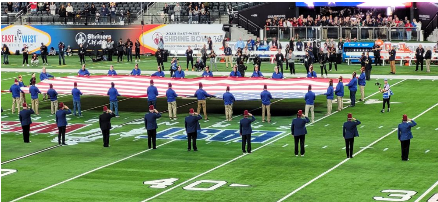
The Imperial Divan, representing all of us Shriners on the field, salute the colors during our National Anthem.