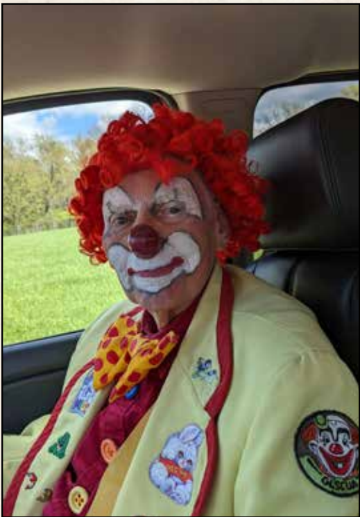
Korvettes, Clowns and the Hunter's trolley were a hit....