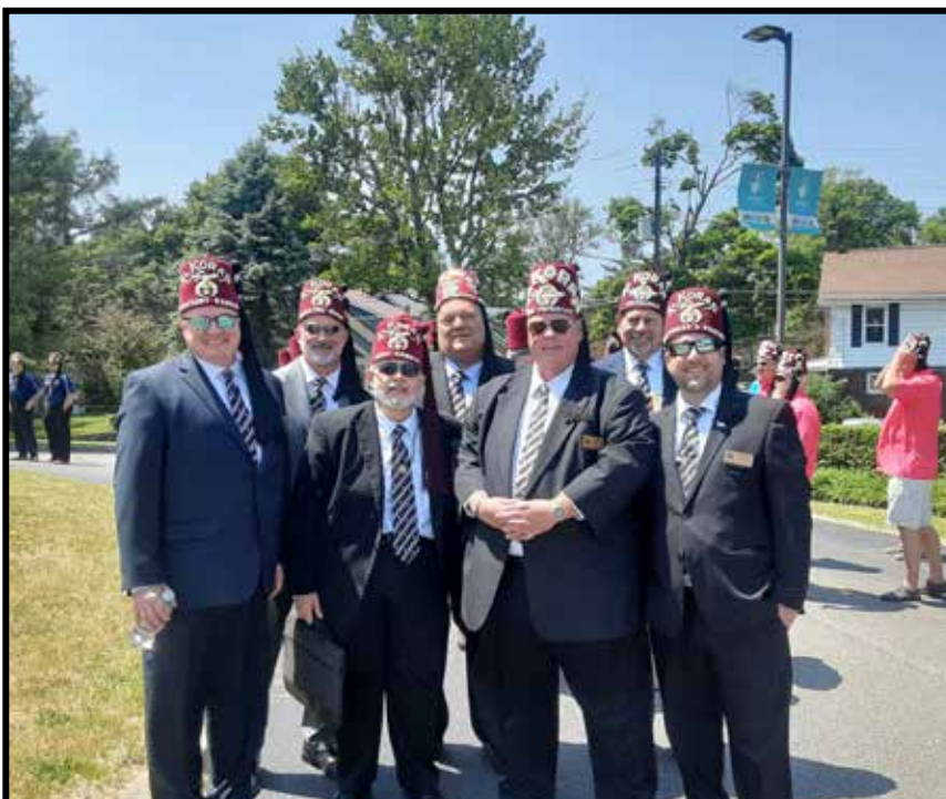
Full Divan at Erie Community days