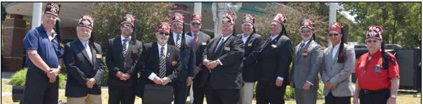
Al Koran representatives at Shiner's Erie's Community Day event

Must be 18 years of age to enter and 21 to receive a handgun. If a winner is ineligible to receive a prize under relevant federal and state laws or local laws, they must take the optional gift card. If winner is unable to pick up firearm in person, it may be shipped to nearest FFL Dealer at winner's expense. Any taxes on items won will be the sole responsibility of the winner. Fin-Feather and Fur will handle all transactions of prizes awarded. All items won must be claimed within 90 days @ Fin-Feather-Fur Outfitters or they become the property of the Al Koran Sportsman's unit.