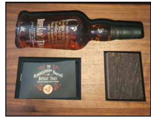
BS unit is doing a raffle for a bottle from the 6 millionth barrel of Buffalo Trace bourbon. Wood case case, Bottle, wood stave and booklet on the barrel is included. Tickets are $10 dollars each and only 300 are available. If anyone needs tickets they can contact Brandon Gould or Mike Spisak.