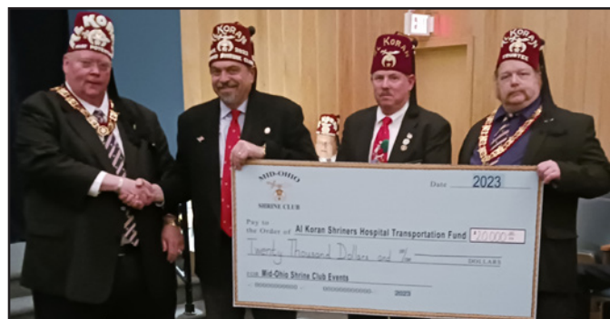
Mid Ohio Donations