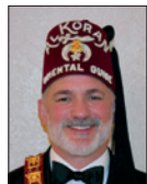
High Priest & Prophet