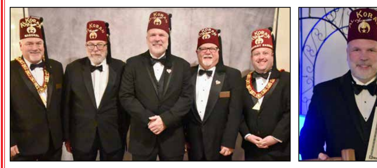
Lakewood Shrine Club 2024 Officers

Wishing you all a Happy New Year filled with laughter, prosperity, good health, and the enduring spirit of fellowship. We hope to see each of you at one of our events which are on the 2nd Wednesdays each month. We meet at the Cleveland Yacht Club and start with cocktails at 5:30pm, dinner at 6:00pm, and entertainment or speaker at 7:00pm. Please see our advertisement for reservation information in this newsletter.