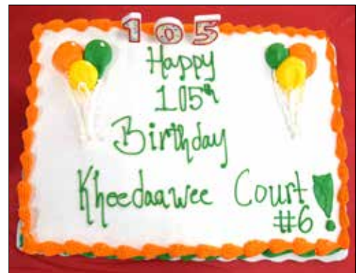
Kheedaawee Court No. 6 of Ladies Oriental Shrine of North America 105th Birthday celebration