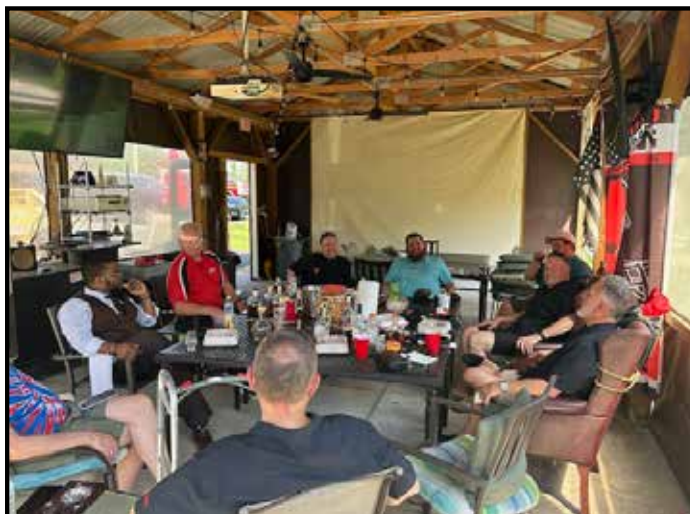
May Event of the Bourbon and Stogies Club