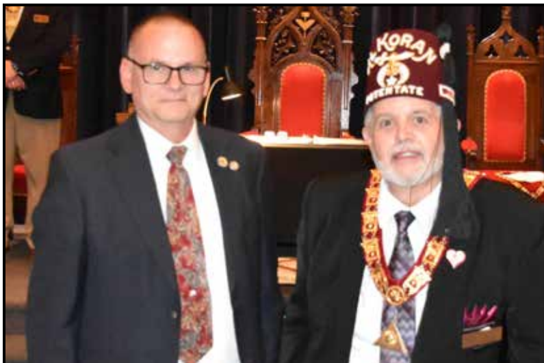
Potentate with our new initiate at the May Board Meeting