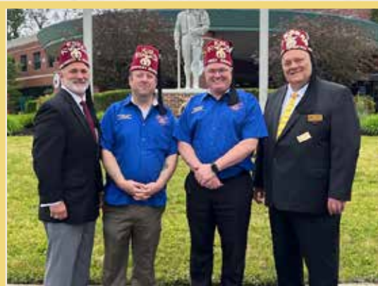
Divan at Shriners Day